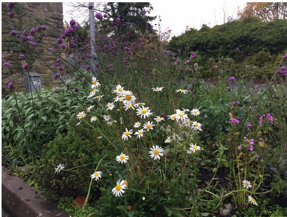
'Shoppers Carpark flowerbed - before and after'

The GGs also tidy up neglected public spaces especially behind the bus-stop and recycling bins.